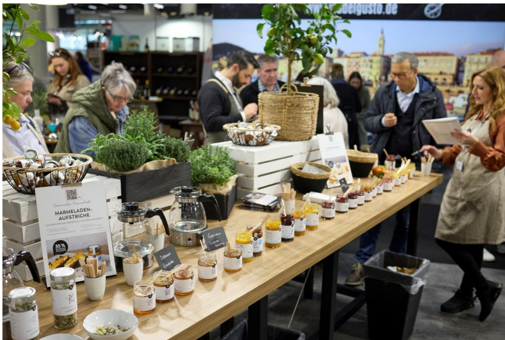
On the upper floor of Halls B1 and B2, visitors can discover fine, spicy and sparkling delights on Nordstil's new gourmet boulevard.

Frankfurt am Main, 7 May 2025. Welcome to the new gourmet boulevard at Nordstil Summer 2025: From 26 to 28 July 2025, the upper levels of Halls B1 and B2 will transform into a vibrant promenade of flavour. Step by step, trade visitors will discover fine delicacies from sweet to spicy, premium beverages – including exclusive offerings from the Buddelhelden – and stylish accessories for kitchen and table. It's the ideal source of inspiration for retailers looking to refine their assortments and unlock new sales potential.