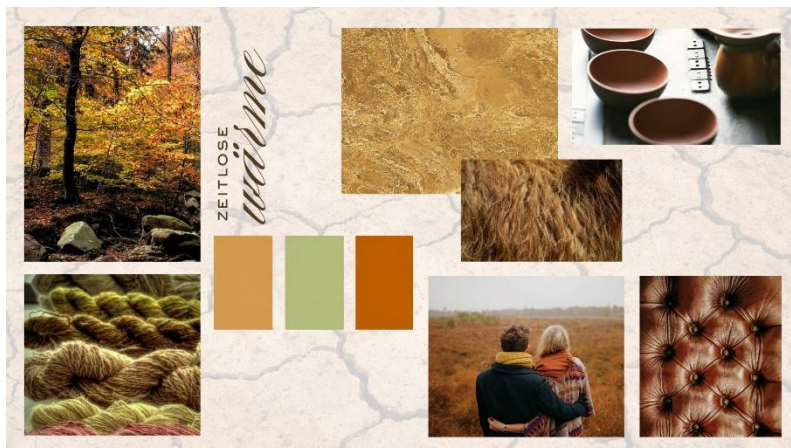
Nature-inspired colours and soft, plush fabrics set the tone for the upcoming autumn and winter collections.