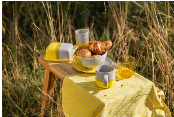
Tranquillo's home collections bring colour and sustainability into the home.

For over 20 years, Tranquillo has been synonymous with colourful fashion, decorative items, stationery and bathroom accessories of the highest quality. The entire range is certified and meets the highest ecological and social standards – from hand-painted ceramics and cosy cushions to practical kitchen gadgets. 'For me, Tranquillo is a prime example of how sustainability can be consistently implemented – from certified natural and recycled materials to socially fair manufacturing processes and genuine transparency in global supply chains. This holistic approach makes the brand a compelling example of best practice in ethical style,' says juror and sustainability expert Mimi Sewalski.