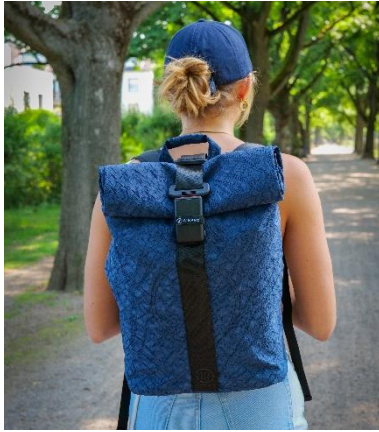
Robust, practical and cool: backpacks from Airpaq.